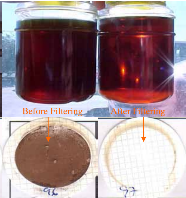
Above are 0.8 micron filter patches done before and after running the samples through the FF 3000