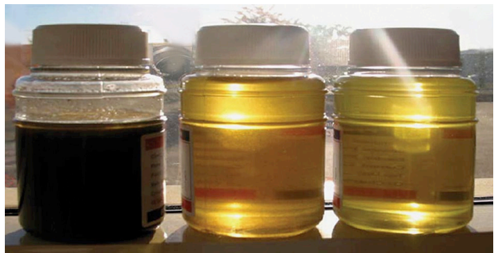
Left - Right Oil entering the filter unit; oil after 8 hrs filtering; filtered oil re-entering the fryer