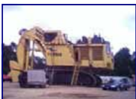
FM 440 Bypass Hydraulics