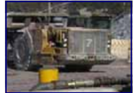
FM 3 Bypass Engine Oil