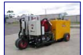
FM 1040T For Finaldrive Oil