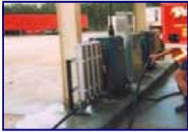
FM 440 Fuel Pump