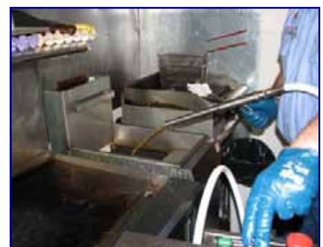
Re-circulating Cooking Oil with FF