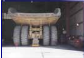
FM 1040T Finaldrive Oil