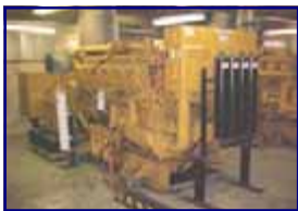
FM4 Fuel & FM 440 Oil