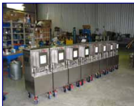
FF 2000 Cooking Oil Machines