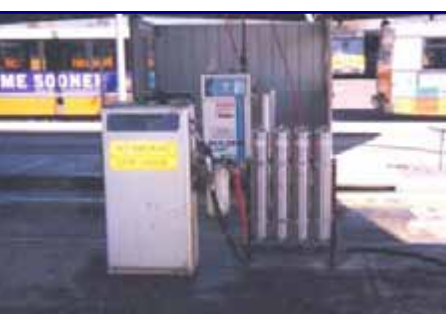
Two FM440 Fuel Pump Units