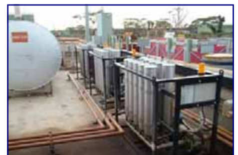
Three FM1040 Units 200LPM 24/7

Filter Technology Australia’s range of unique fuel and oil filters are used in a wide variety of Industries such as mining, transport, agriculture, marine, construction and print media.