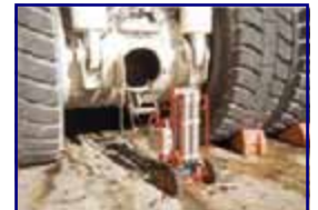
FM 504 Filtering Wheel Motors