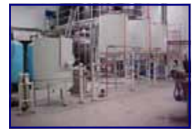
FM 440 Recycling Solvents