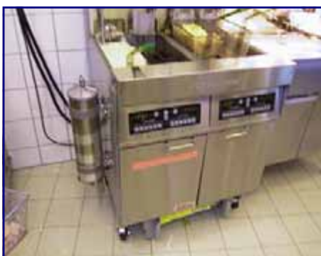
FMC2FU Commercial Deep Fryer