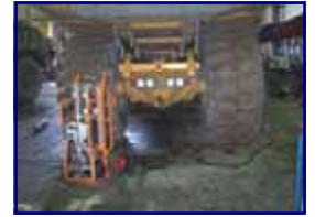
FM 504 Finaldrive Oil

Filter Technology Australia produces a range of both recycling units and off-line filtration systems capable of reducing particulate contamination by up to 96% in cooking oils. Achieving this level of cleanliness allows oil life to be extended up to four times giving considerably savings in oil usage and providing substantial cost savings. Most importantly improved food quality.