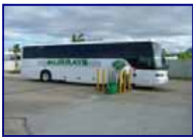
FM 440 Fuel Pumps