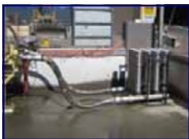
FM 1640 500 LPM Fuel